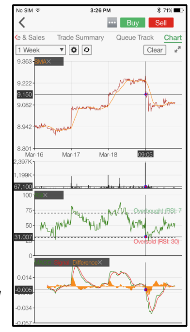
Figure 2: Customers can now perform detailed technical analyses on stocks using common indicators.

The app introduces a host of other features to cater to the preferences of different users, including sophisticated investors who wish to conduct in-depth market research on the go. These features include comprehensive stock charting, a customisable home page and a dual language function that enables customers to view content in Chinese.